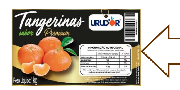
Each Clamshell has a label that provides the required information according to the regulations of the destination country.

It is our desire and challenge to continue working on the development of these types of strategies that satisfy our customers